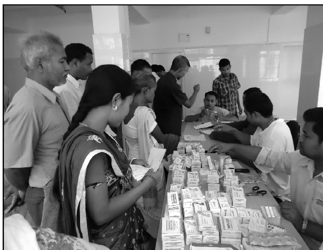
A scene of a Mental Health Camp

Regular Home Visit was made to follow up the progress in recovery of the people with psychiatric illness preventing them from relapses. Total of 75 families have been visited in last one year. In these visits, family coun-seling was also