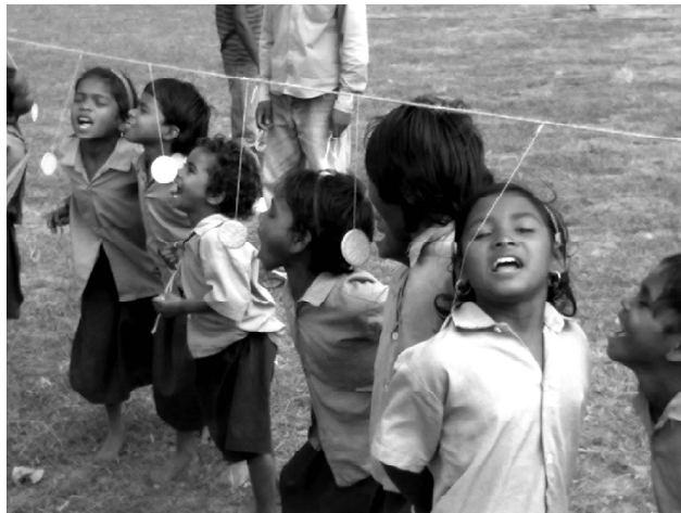
Aflatoun Children Playing

The Education team of NERSWN had completed three years with Aflatoun Child Social and Financial Education programme. Through the journey of three years together with Aflatoun, NERSWN have been able to produce 42 Trainers, 192 Trained Teachers covering 190 government schools reaching out to 8795 children. These children are now collectivised into 65 Children's Club and Children's Bank.