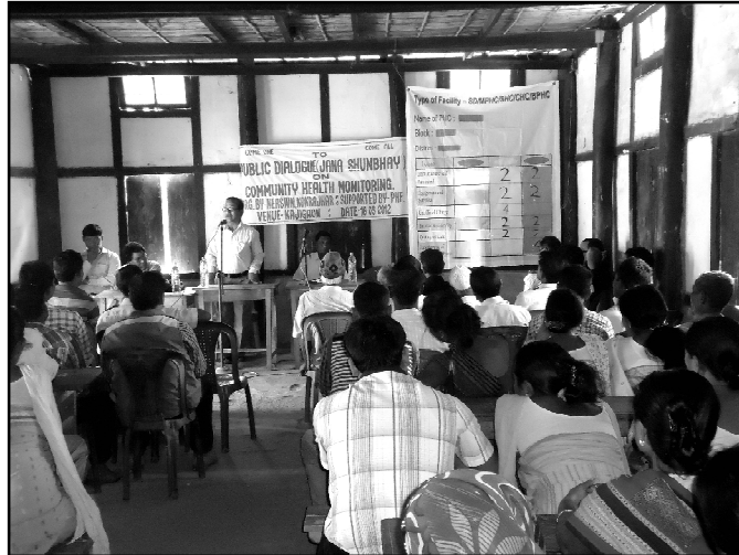
Jt. Director, DHS, Kokrajhar addressing the public during a public dialogue.

Public Dialogues: Total of two Public Dialogues have been held in last one year. In both the public dialogue there was huge participation of people. The Department of Health Services also had attended with good numbers of health personnel including the district heads of different health programs