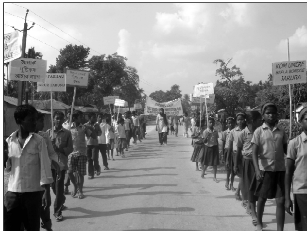
Children's Rally for their rights

Kokrajhar being devastated by unending conflict of different nature since last three decades is still facing a stiff challenge. All wings of governance have struggled to function. Majority of families in the district have experienced internal displacement at one or other point of time in last three decades. The inhabitants of the district were forced to live like refugees in their own land.