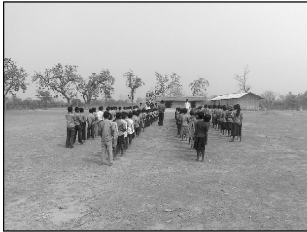
Pupils of Suluk-Gwjwn Vidyalaya

The NERSWN workers have pursued with the education department and got the newly set up school recognized under RTE (Right to Education) Act 2009. In order to fully provincialize the school, the NCPCR has been approached. A written note has also been given to NCPCR, Delhi. The local supervisors have visited the school once. But it still awaits a positive response from the government.