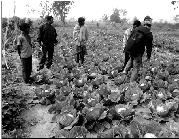
Vegetable Demo Site at Jhawarbil

Experimenting ideas, sharpening skills by dirtying hands and legs, seeing unseen, trying the untried, selling the unsold and many more. These small but yet interesting moved have shaped our livelihood intervention in the year gone by. We genuinely hope that these will help us to be more deliberate in promoting livelihood of the people who are at the periphery of social living due to the extreme exclusion. Following are some of the humble initiatives that NERSWN made this year-