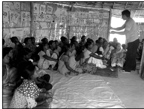
Community meeting at Sapkata

Since the places resettled by former relief residents are deforested areas, and are now categorized as encroachers. Hence not to face the same and to push for recognizing these villages under ST & Other Forest Dwellers (Recognition of Forest Rights) Act 2006 has been initiated. Several rounds of talks have been held with the DFO of the