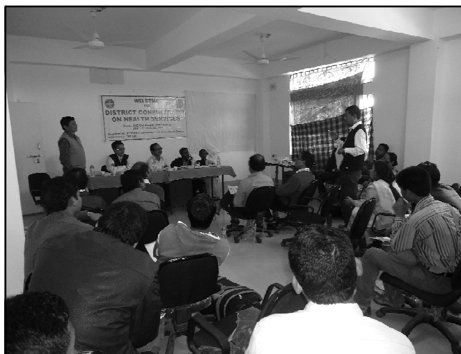
Public interacting with officials during district consultation

of health department. The social organizations like All Bodo Students Union, All Bodo Women Welfare Federation and many NGOs in the district have attended the program. The media personnel also actively took part and highlighted the issues.