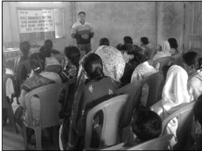
Workshop VHSC Members

The community monitoring which had succeeded in creating a democratic space for dialogue between the community and health authorities to resolve health related issues and problems which hitherto would have been the relation of receiver and